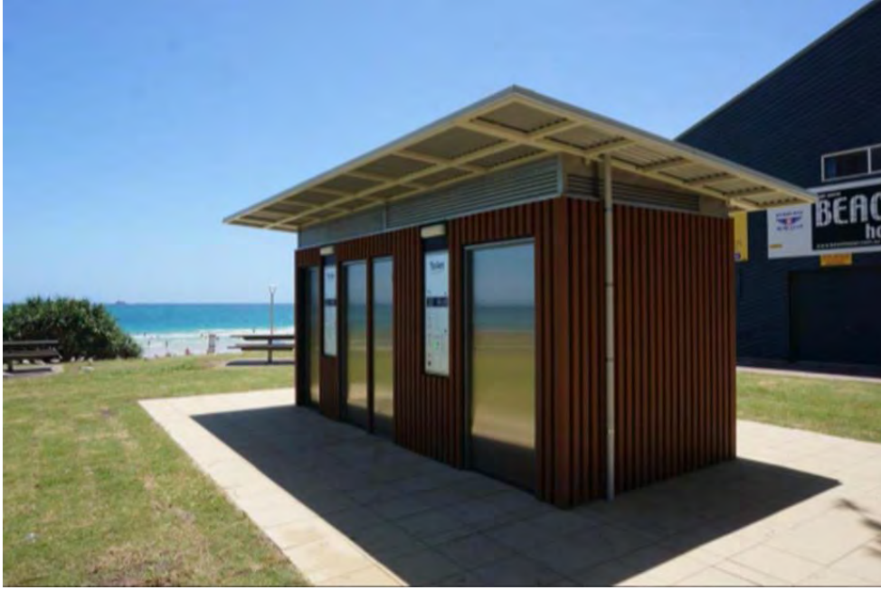
Example toilet block (note this is a 3 pan)